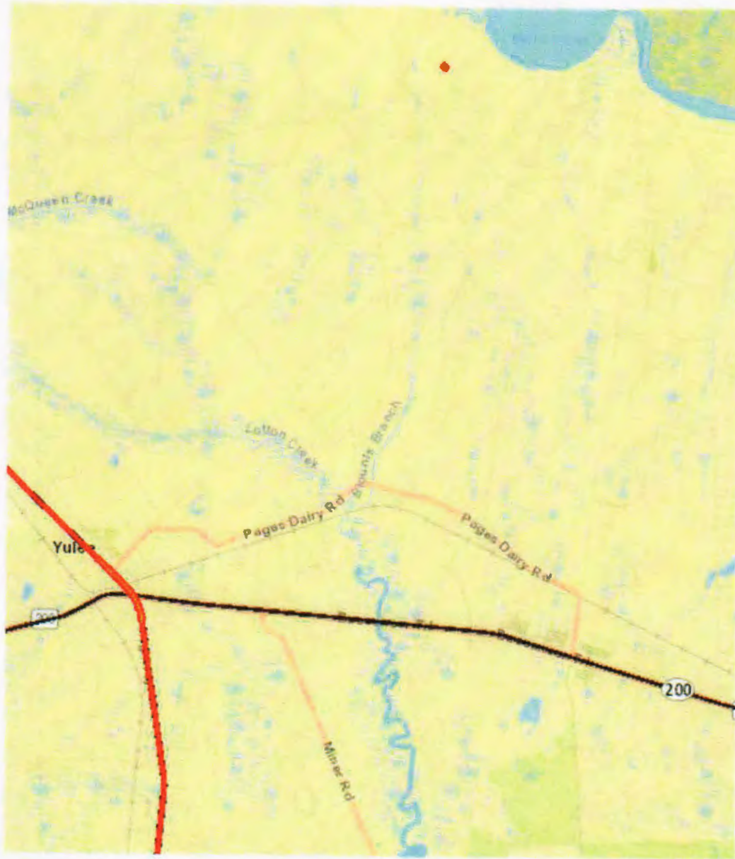
Exhibit B-2 – Location Map

Parcel Identification Number: 39-3N-27-0000-0001-0010