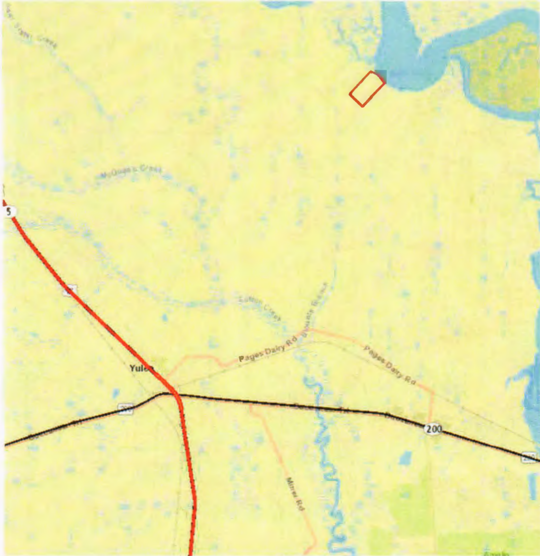
Exhibit B-1 – Location Map

Parcel Identification Number: 39-3N-27-0000-0001-0000